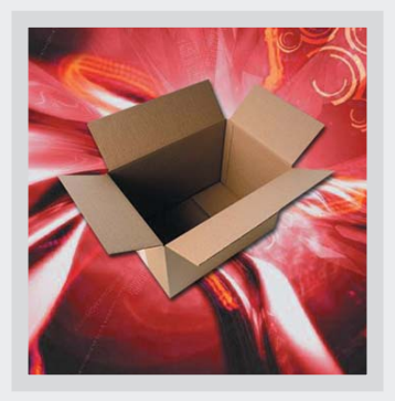
Little David delivers packaging equipment that works for you