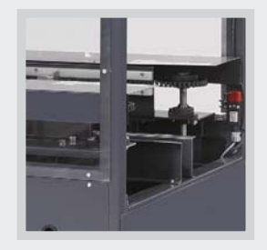
Chain and lug provides positive drive